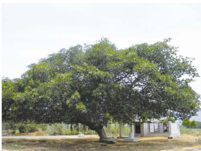
Figure 1. A typical Ficus benghalensis tree located next to a temple at the study site.

The best models predicting bird visitation included DBH of the focal tree and the summed DBH of neighbouring trees (Table 2). The best model incorporated both the size of the focal tree and the DBH of the surrounding trees, whereas the second best model ( \Delta AIC_c = 2.40 ) incorporated only DBH of the focal tree. All other models had \Delta AIC_c > 3 . The summation of the Akaike weights between models for different variables predicting bird visitation revealed DBH of the focal tree to be the best predictor of bird visitation ( \Sigma w_{ic} = 0.99 ),