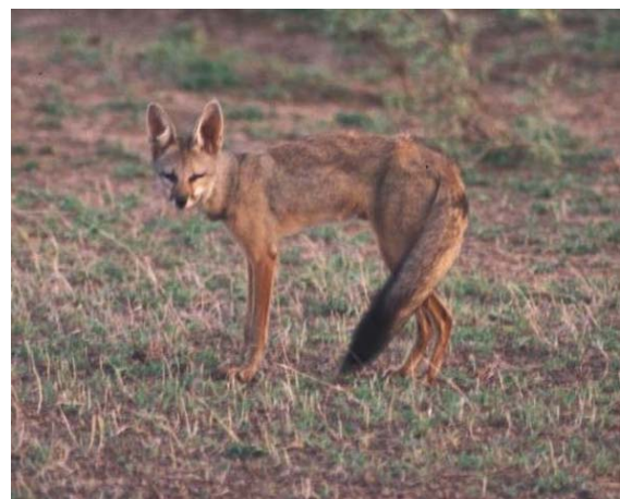
Figure 1. Indian fox, easily identified by characteristic black-tipped tail.

The Indian fox Vulpes bengalensis is endemic to the Indian subcontinent (Figure 1), one of two fox species recorded in this region (Menon 2003). Three subspecies of red fox also occur: desert fox Vulpes vulpes pusilla , Kashmir fox V. v. griffithii and Tibetan fox V. v. montana .