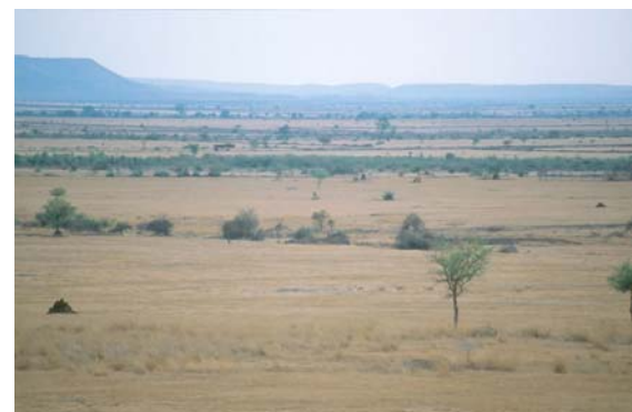
Figure 3. Semi-arid short grasslands of Rollapadu Wildlife Sanctuary, among the most endangered eco-systems in India.

Rollapadu Wildlife Sanctuary (Kurnool District, Andhra Pradesh) – In the plains between Yerramalai and Nallamalai hills of Andhra Pradesh (Figure 3), 6.1km 2 of undulating semi-arid short grassland established in 1988 for the protection of Great Indian bustard.