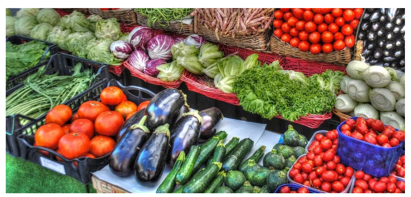
Representative image of vegetables.

Home \ | \ DH \ Changemakers \ | \ India \ | \ Karnataka \ | \ Opinion \ | \ World \ | \ Busi