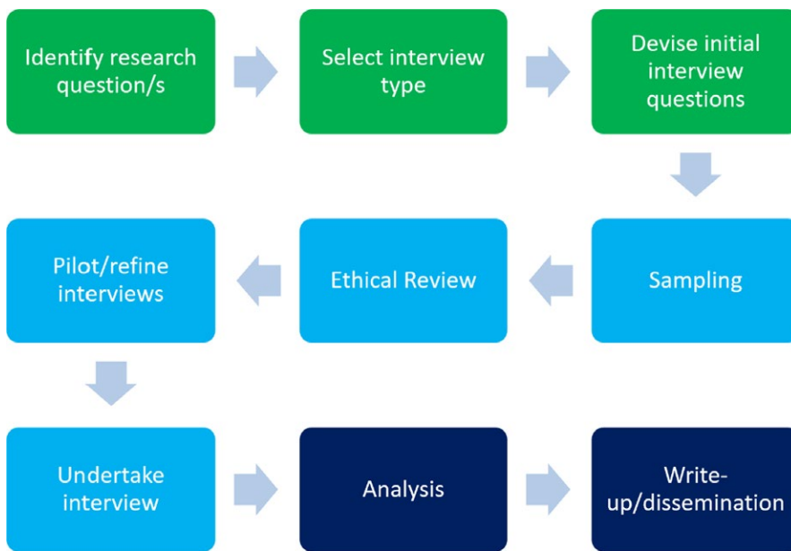
FIGURE 1 Basic stages in an interview process: initial project design (stages 1–3), data gathering (stages 4–7), analysis and write-up (Stages 8–9)

interview is the most suitable methodology to use based on the question and whether the interview should be supplemented with other methods. Key areas to consider at this stage include whether interviews can provide the right kind of data for envisaged outputs or whether other research techniques might be more suitable. In making this decision, researchers could weigh up the advantages and disadvantages of interviews as a methodology in the light of their research question(s), including different styles of interviews (structured, semi-structured and unstructured).